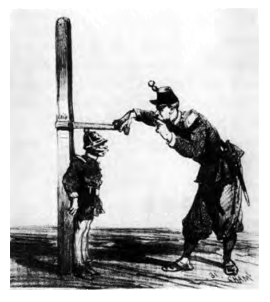
A British cartoon published in 1867. France is saying to Prussia: Now you are big enough. You must not get any bigger. I'm telling you this for your health.'