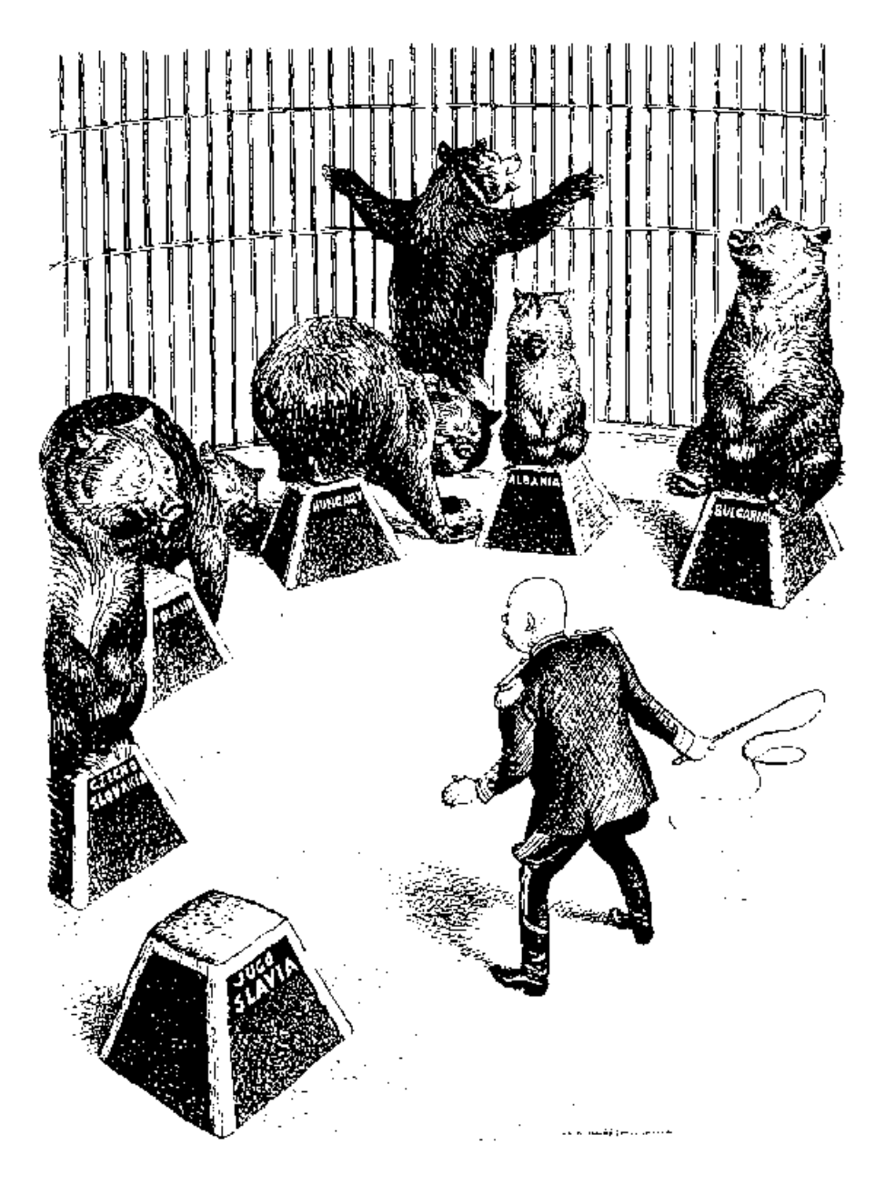
A British cartoon published in October 1956. The man in the centre is Khrushchev.